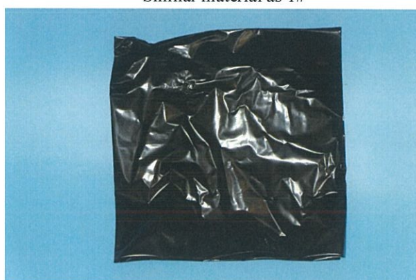
Similar material as 1#

Remark : The above testing result reflects the quality of the samples provided by applicant only; it does not represent any shipment.