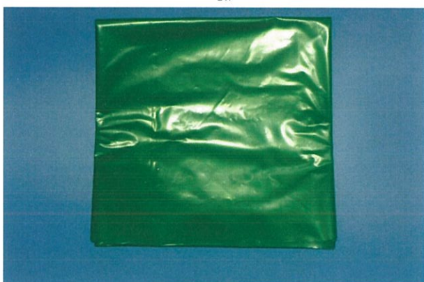
Similar material as 1#