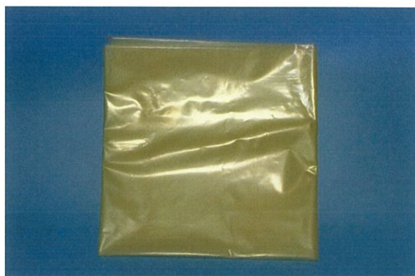
Similar material as 1#